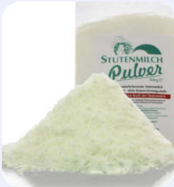
Mare's milk from Germany, from the company Stutenmilch-Produkte Haflingerhof