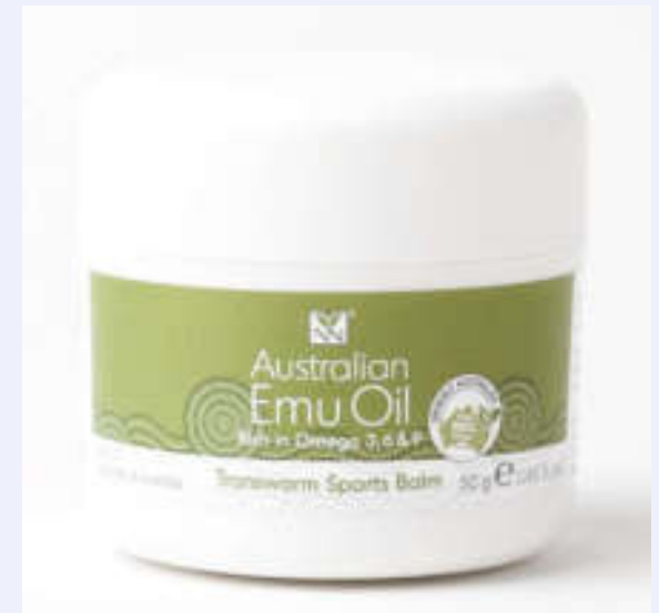
Emu oil produced and processed in Australia, from the company Y Not Natural (YNN)