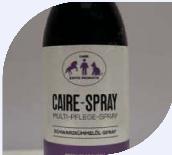
Black cumin seed oil from original Egyptian black cumin seeds, processed in the Netherlands